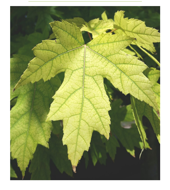
Iron chlorosis symptoms